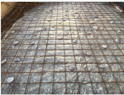
PRAYER ROCKS LAID IN THE FOUNDATION