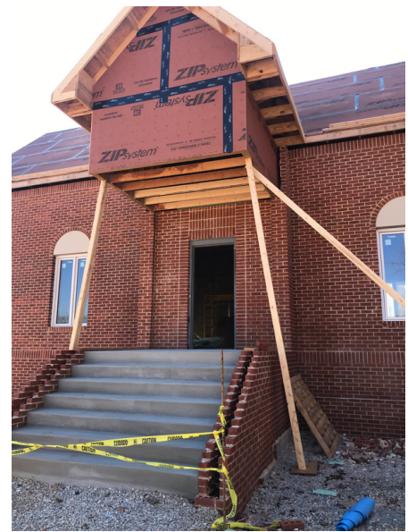
PORCH LEADING FROM THE CHOIR ROOM TO THE COURTYARD/COLUMBARIUM