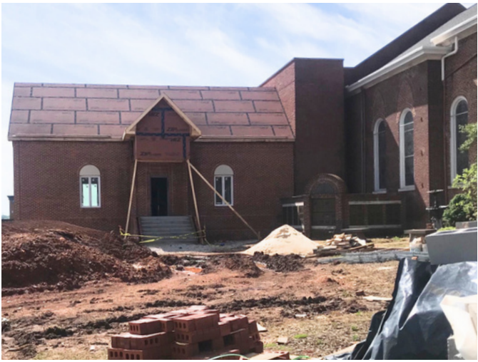
VIEW FROM MOBILE STREET