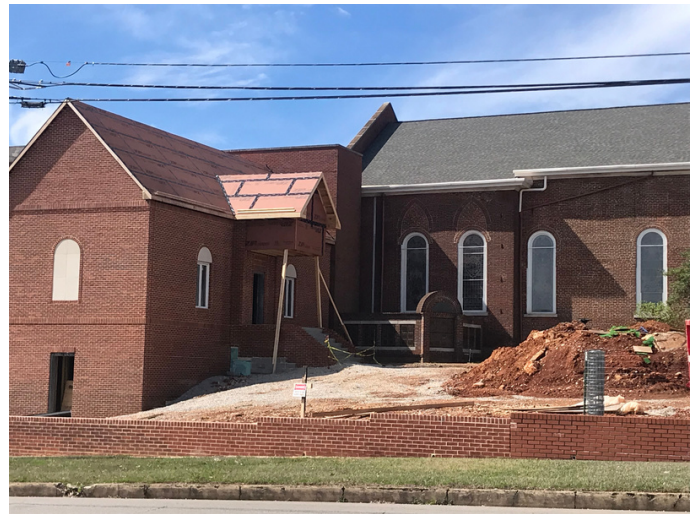
NEW BRICK RETAINING WALL