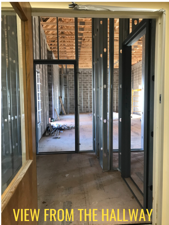
VIEW FROM THE HALLWAY