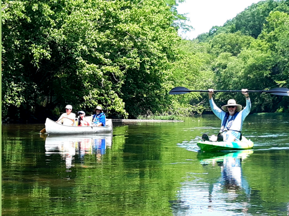
Picture: Kayaking Event 2023

THE OFFICIAL NEWSLETTER OF FIRST PRESBYTERIAN CHURCH