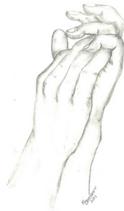
Art work by Morris Cracraft