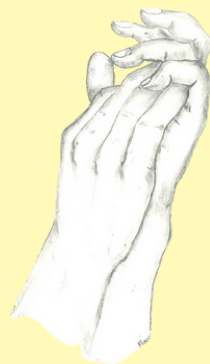
Art work by Morris Cracraft